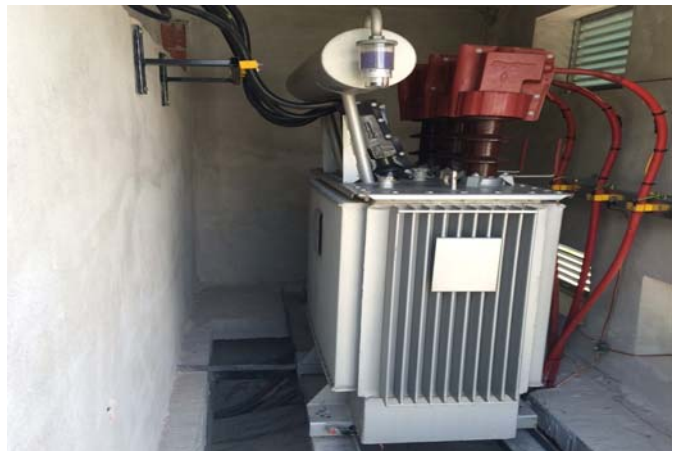
New Municipality Building - Glogovc