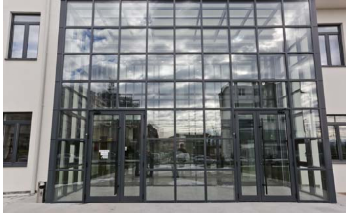
New Municipality Building - Glogovc