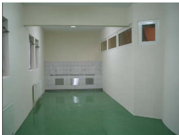
Dubrava Prison _ Bl. 2